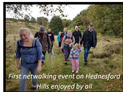
First netwalking event on Hednesford Hills enjoyed by all

Noon Sunday 19 th November Meet Ironstone Road bus stop