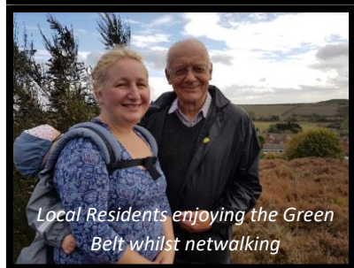
Local Residents enjoying the Green Belt whilst netwalking